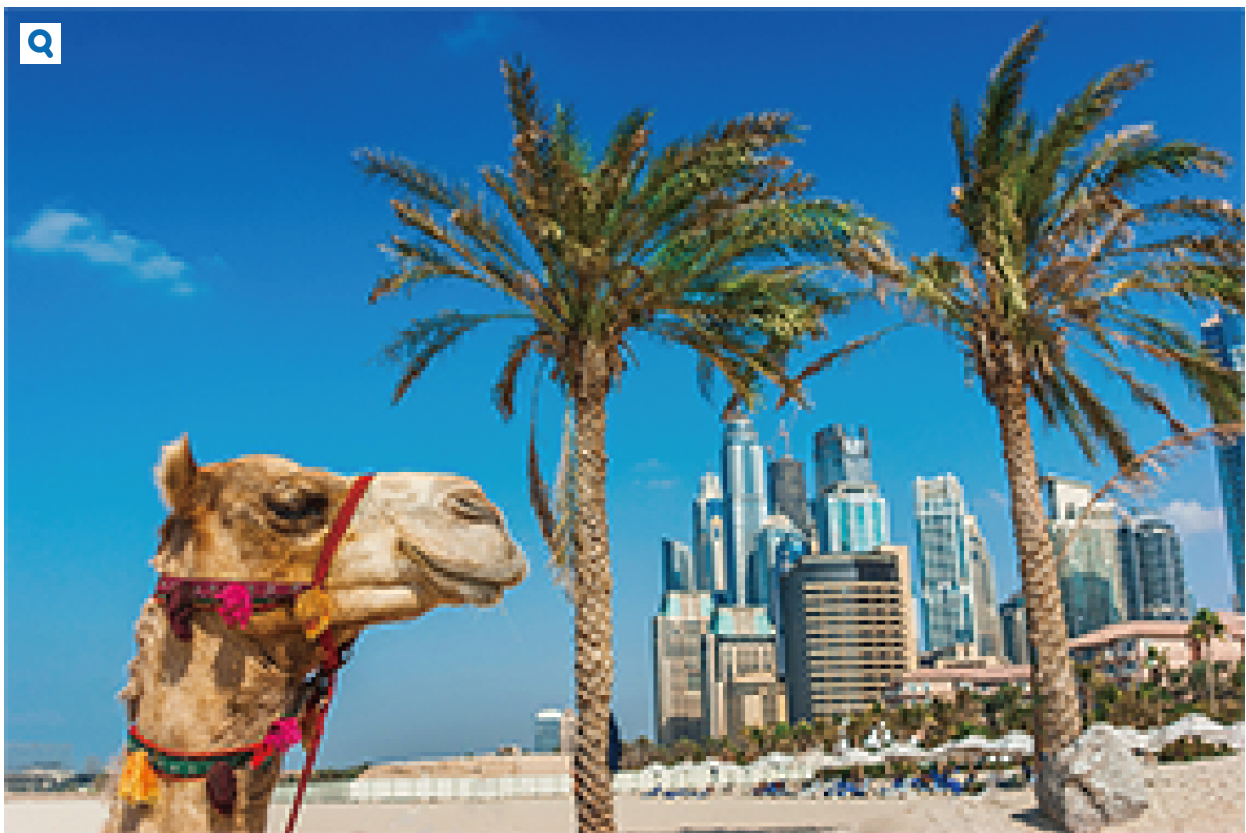
300dpi (upsampled image, the distortion is very apparent)